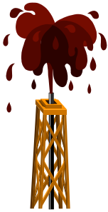
Oil & Gasoline

Northwest Linings has the solution for complete containment that is DOE and DEQ approved in all Pacific Northwest states.