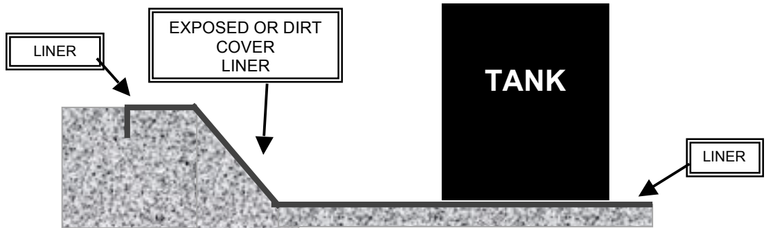
SIDEVIEW OF FIRE WATER POND

Whether it be a 5,000 SF or 3,000,000 SF area Northwest Linings has the best lining product for your budget. Our complete geomembrane line includes PVC, HDPE, Polypropylene, Hypalon, and many more.